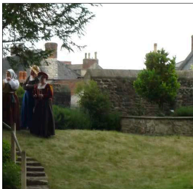
The Strawberry Tree, 2011

Our Old Deanery Garden is one of the secret gardens she has featured – come and hear about some of the others! FN.